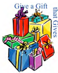
Alternative Giving Market